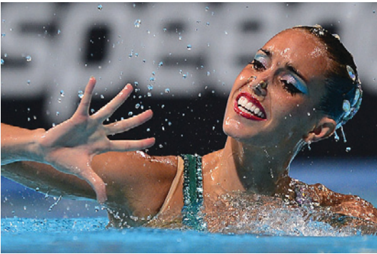
Ona Carbonell Olympic medalist - Synchronised Swimming -