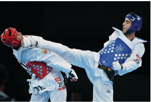
Joel González Olympic champion - Taekwondo -