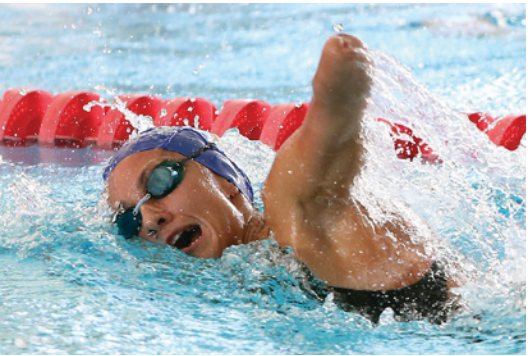
Sarai Gascón Paralympic medalist - Swimming -