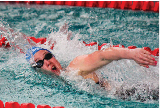
Mireia Belmonte Olympic medalist - Swimming -