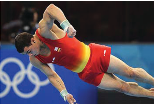
Gervasio Deferr Olympic medalist - Gymnastics -