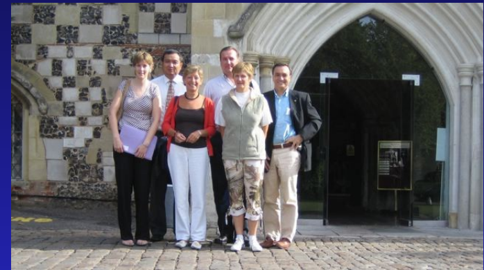
Bisham Abbey, London August 2006