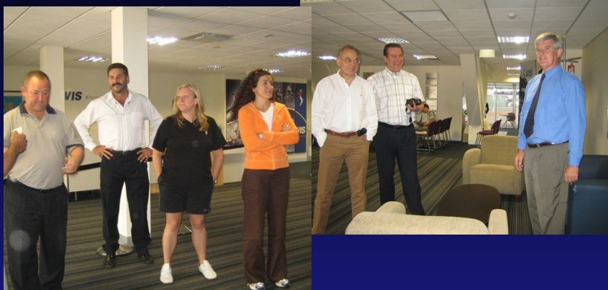
Melbourne, March 2006