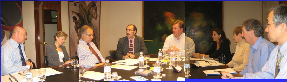
Madrid, February 2007