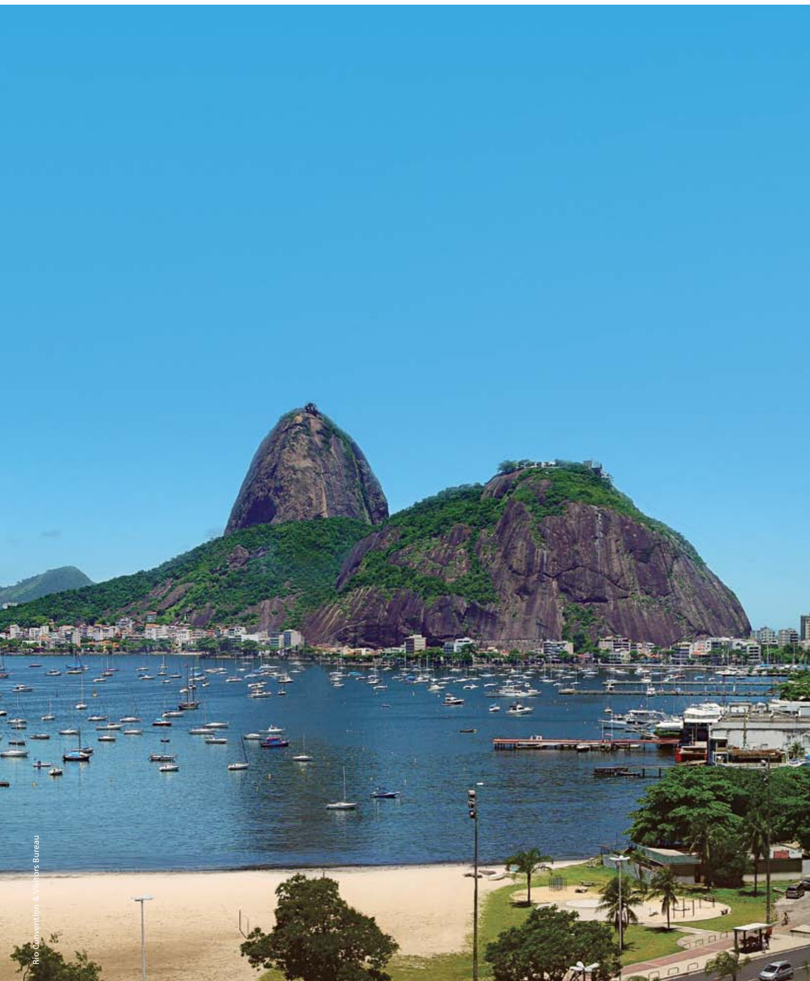
Rio Convention &amp; Visitors Bureau