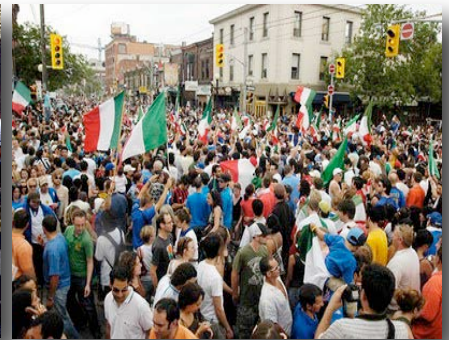
Toronto's Little Italy

Although Toronto is a highly urbanized area, nature is only a stone's throw away at Canada's largest botanical garden, the Royal Botanical Gardens and at the Niagara Escarpment, running the length of the entire Niagara Region.