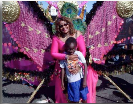
Toronto's Annual Caribana Festival