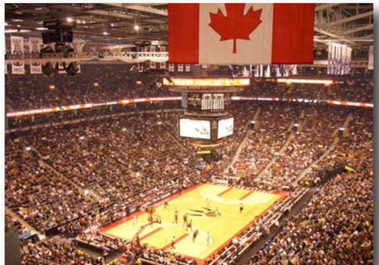
Air Canada Centre, Home of: The Toronto Maple Leafs (NHL), The Toronto Raptors (NBA), &amp; The Toronto Rock (NLL)

Toronto is a thriving centre for high performance sport, both amateur and professional. These professional sport organizations have carved out a notable place in Toronto's community. The city is home to Major League Baseball's Toronto Blue Jays, the National Basketball Association's Toronto Raptors, Major League Soccer's Toronto Football Club, the National Hockey League's Toronto Maple Leafs and the Canadian Football League's Toronto Argonauts. Toronto has also hosted a number of international sporting events including the 2007 FIFA U-20 World Cup and the Roger's Cup Tennis Open. Toronto is home to world-class sport. The facilities used by Toronto's professional sports teams are elite venues and are part of the Toronto 2015 Pan/Parapan American Games plan. These venues include: the Rogers Centre, the Air Canada Centre, the Rexall Centre, and the BMO Soccer Stadium.