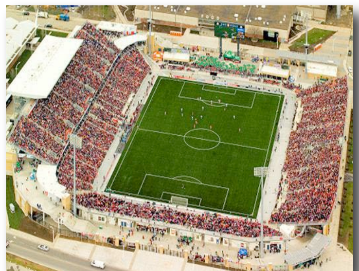
BMO Field, Home of: The Toronto Football Club (MLS)